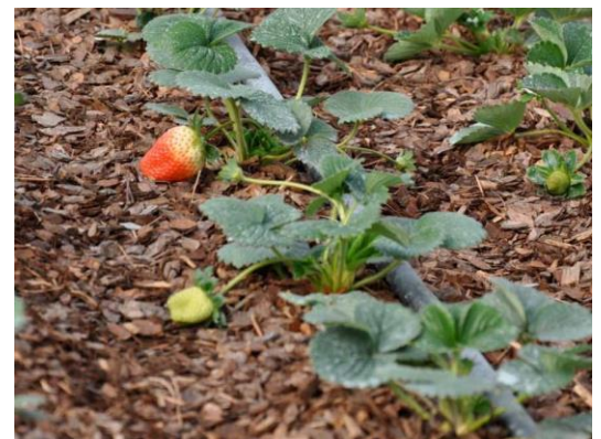
Figure 1. Drip irrigation applied at the surface for strawberry production.