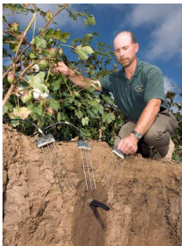
Figure 2. SDI placed deep in a cotton field allows for long lifetimes and avoids interference from tillage. Soil-water monitoring probes allow for measurement of soil moisture.

term use. Emitter flow rates for SDI are generally less than 3 gallons per hour. SDI can have a useable lifetime of up to 20 years, making it the most economically competitive with center pivot irrigation of low-value commodity row crops (Lamm et al. 2010).